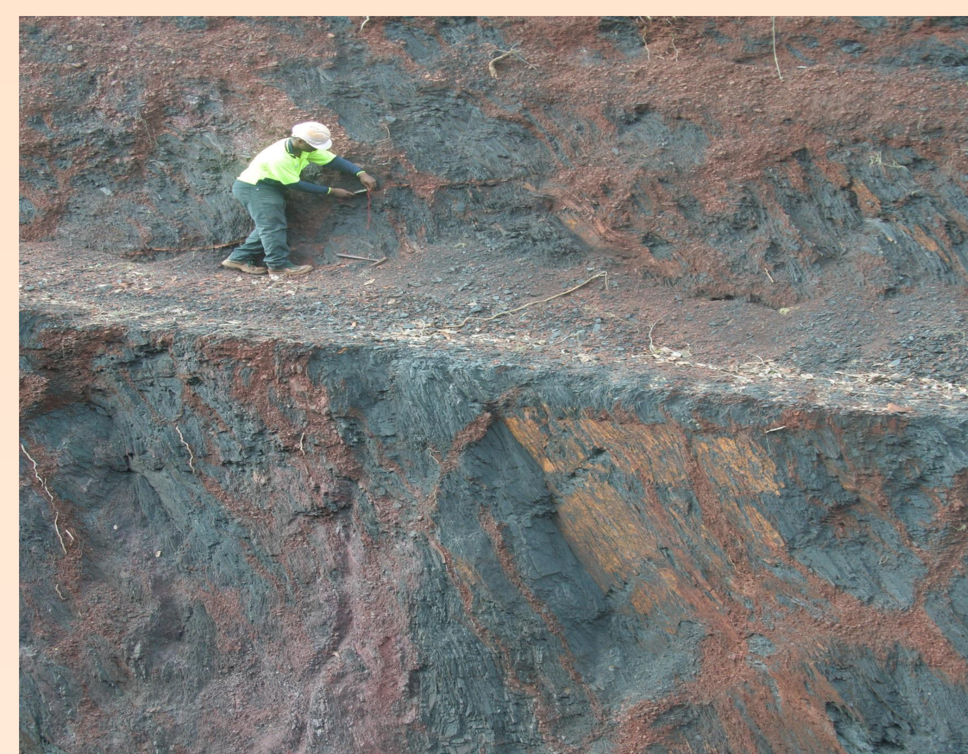
Figure 4: High grade enriched soft laminated (biscuity) supergene ore (DSO) at Mbalm. DSOs are limited or related to a very well defined plateau with deep soil and areas of laterite development.