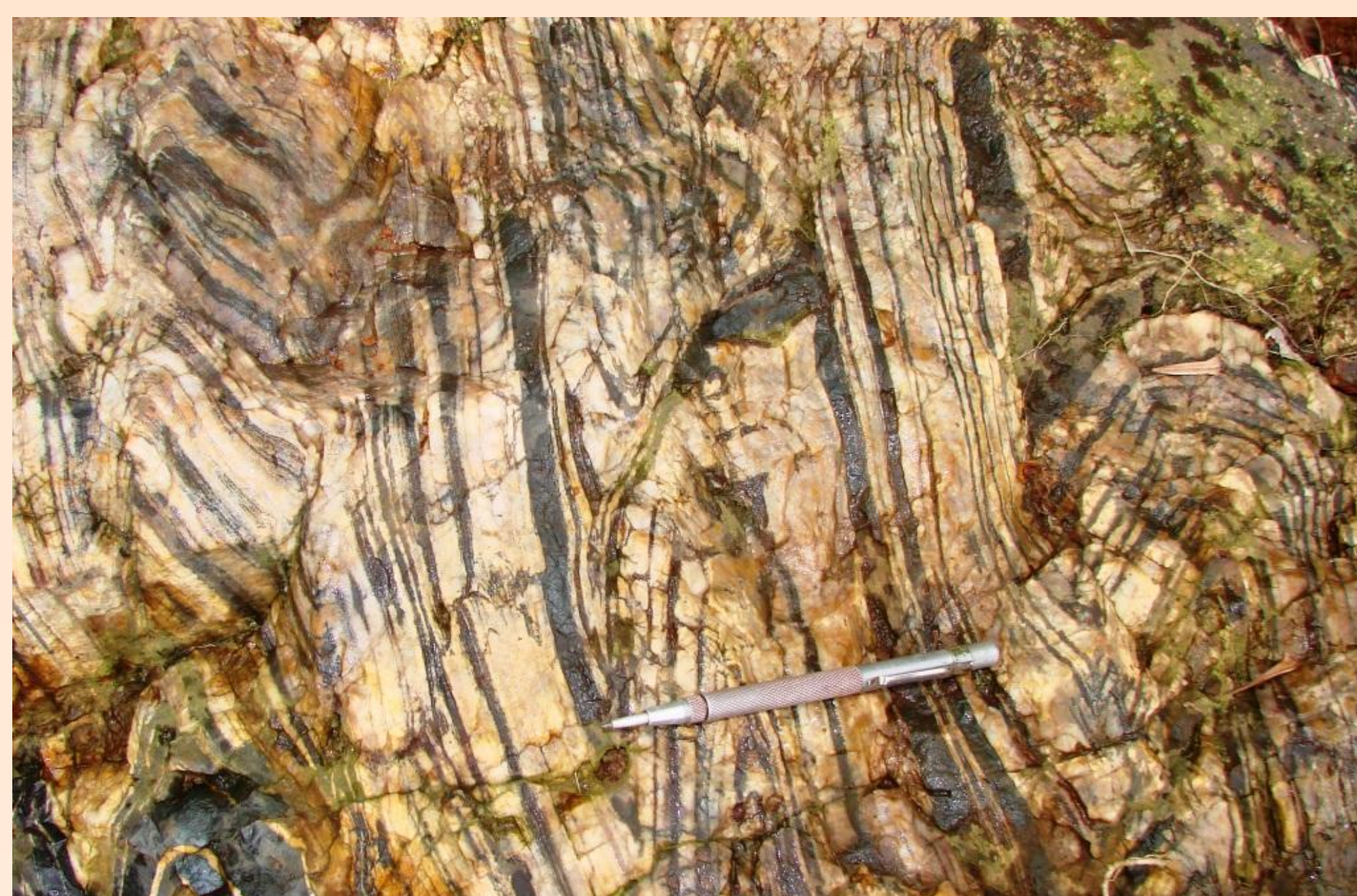
Figure 3: Itabirites of Mbalm Iron Ore Project are typically gray-brown to dark grey in colour, show pronounced bands and or laminations of iron oxides and silica, and have been tightly folded with subvertical plunge of the fold axis.

Unconformably overlying the Archean rocks in the Project area are flat dipping, metamorphosed and deformed sandstones, conglomerates and shales of the Lower Dja Series. These rocks represent fluvial, deltaic and shallow marine sedimentary rocks that have been correlated with the Franceville Series in Gabon and dated at about 2,150 million years. In the Mbalm area the discontinuity between the Archean rocks and overlying Lower Dja Series is marked by a conglomerate horizon. This unit is an important host rock for uranium mineralisation in the Franceville Basin.